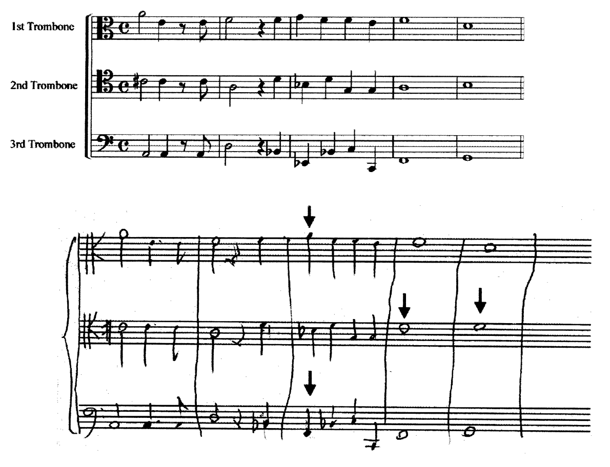
Fig. 3. Results of tests of the ability to write musical scores that the subject knew well. The subject was instructed to write from memory the notes of the trombone chorus of the fourth movement in Symphony No. I by Brahms. He knew the tune well, and was able to hum it. The correct score is shown above, and the score written by the subject 2 weeks after the hemorrhage is shown below. Arrows indicate errors, all of which are attributable to incorrect musical intervals.

In order to evaluate the subject's reading ability, we instructed him to silently read the leading article in a newspaper, which contained 600 Japanese characters, having first ensured that he had not previously read the article. He was instructed to read it as usual, not to read