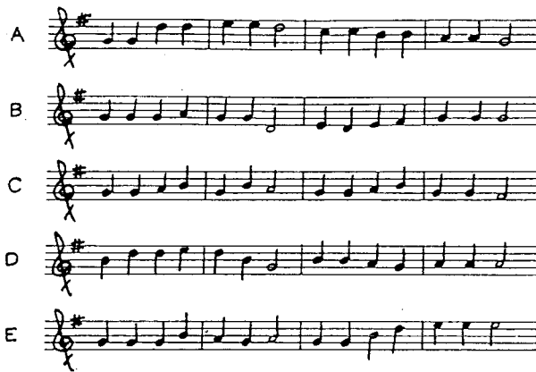
FIG. 3. The first two phrases of each of the undistorted versions of melodies used in Expt. 2: (a) "Twinkle, Twinkle, Little Star"; (b) "Good King Wenceslaus"; (c) "Yankee Doodle"; (d) "Oh Susanna"; and (e) "Auld Lang Syne."

and ascending two octaves (to 2093 Hz). Every effort was made to maintain the same tempo in all stimuli. Stimuli were tape recorded and played to the subjects over loudspeakers as in Expt. 1.